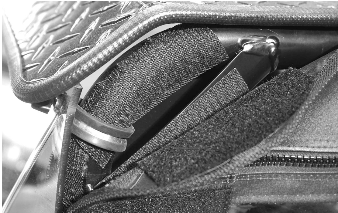
5" Adhesive strip in the rear