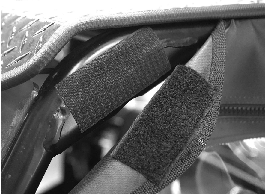
4" Adhesive strip in the front